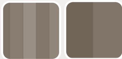
Shade Variation: LOW-MED