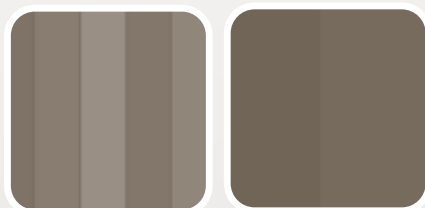
Shade Variation: HIGH